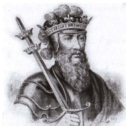
Edward III (from Cassell's History of England 1902)

In June 1328, Edward III, one year into his reign and under the domination of his mother and her lover Mortimer, issued a decree from Evesham ordering all ships over 40 tons burthen to be brought back to their ports. The mayors, bailiffs and communities of the ports, including Portlemue , were required to provide these ships with men and victuals, arms and other necessaries and to be ready to provide a defence against ' malefactors assembled on the coasts of Normandy and Poitou to aggrieve and rob merchants and other subjects of the king.' 28 Ten years later, in 1338, Edward III, now firmly secure on his throne, issued a proclamation to the bailiffs of ports, including Portlemue , which was aimed at stamping out acts of piracy against foreign merchants