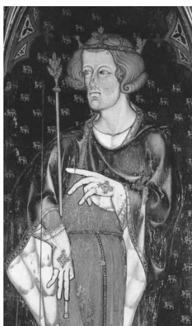
Edward I

The ships 'of Portlemouth' – be they from the east or west of the 'port's mouth' or from the estuary as a whole – were summoned by royal writ on at least eight occasions during the fourteenth century to help fight the King's enemies in Scotland and France.