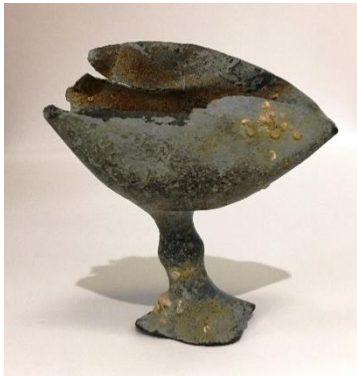
The pewter cup, believed to be a communion chalice from the Spanish ship St. Peter the Great