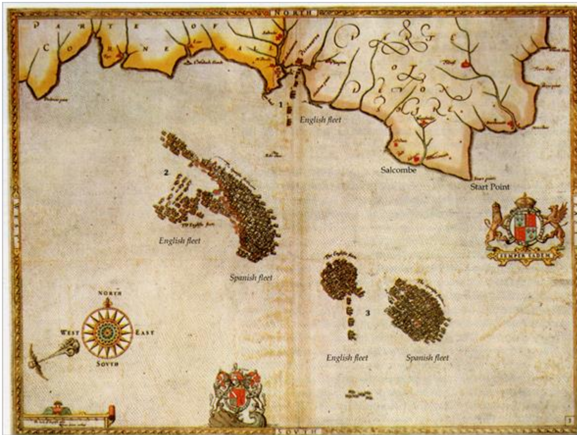
Two of a series of engravings commissioned by Lord Admiral Howard charting the early phases of the Channel fighting between the English and Spanish fleets (National Maritime Museum, Greenwich)