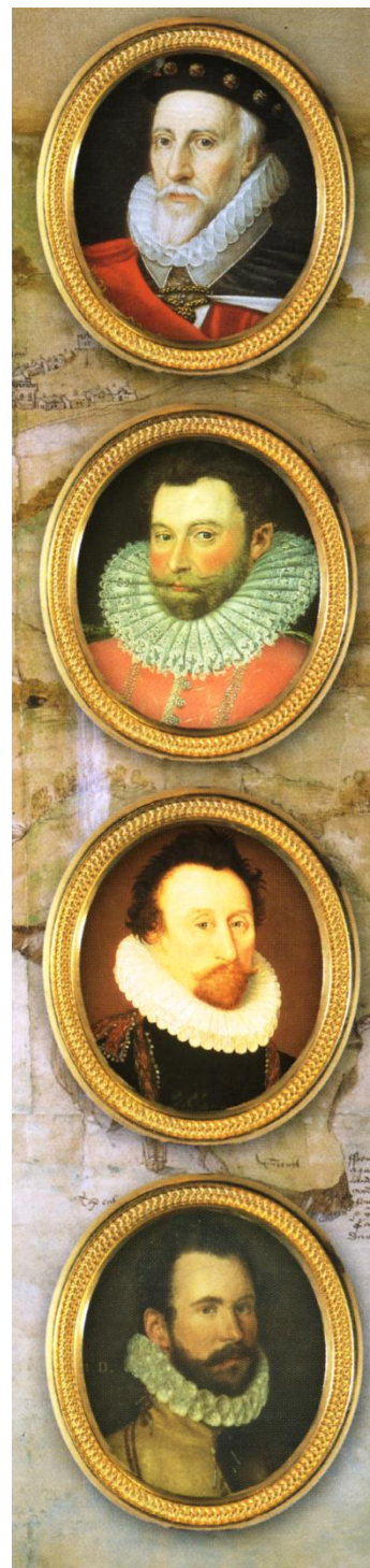
High Admiral, Charles Howard; Sir Francis Drake; Sir John Hawkins; Martin Frobisher