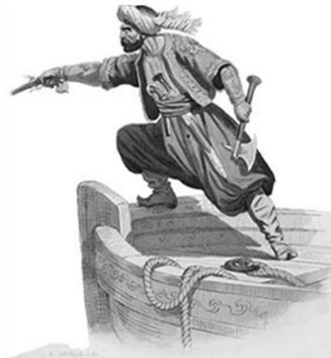
The notorious Barbary corsair Dragut Rais

A common complaint was that the Turks raided the coast whilst 'the King's ships still lie